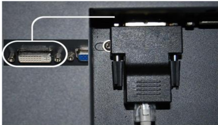
DP-10 receiver connection