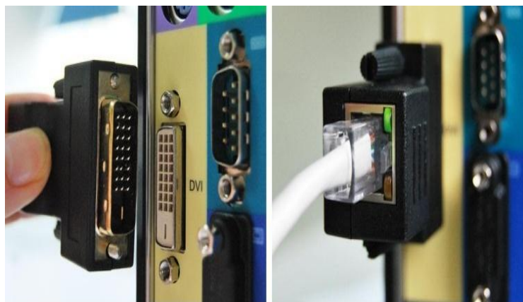
DP-10 transmitter connection

Connect the transmitter (DP-10-T) and the receiver (DP-10-R) through CAT.6 cable. Connect the transmitter to the DVI signal source and connect the receiver to the display device. As shown below: